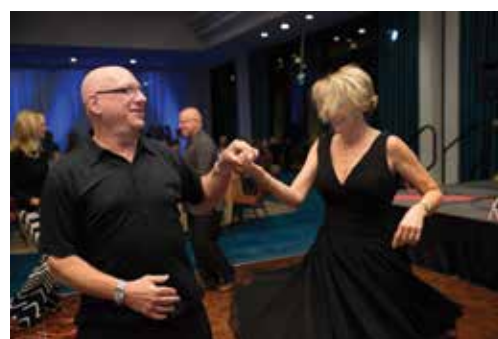
2014 Annual Sessions Foundation Event

screenings with the help of FNLA and NLA volunteers. The first successful event utilizing the machine took place at the Yankees FanFest held in New York City in September 2014, with the help of several NELA Board Members. The volunteers were busy providing screenings for the entire duration of the event and were able to help more than 60 individuals by providing each of them with their cholesterol numbers and guidance on how to better manage their numbers. With the acquisition of the machine, the Foundation can now help educate more patients at screening events in the future.