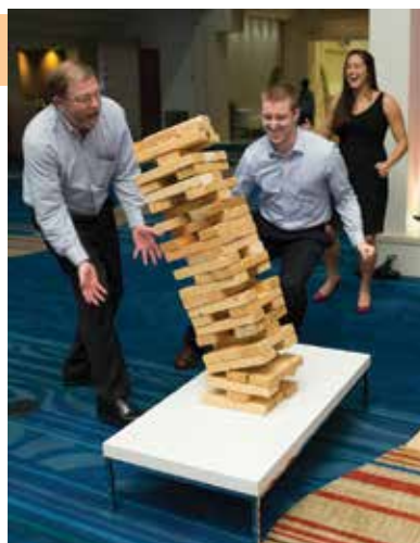
2014 Annual Sessions Foundation Event

As part of the community outreach component of the Triglyceride Awareness Campaign, the Foundation was able to purchase a Cholestech LDX Machine and related materials (banner, case, etc.) in order to participate in patient community events and offer cholesterol